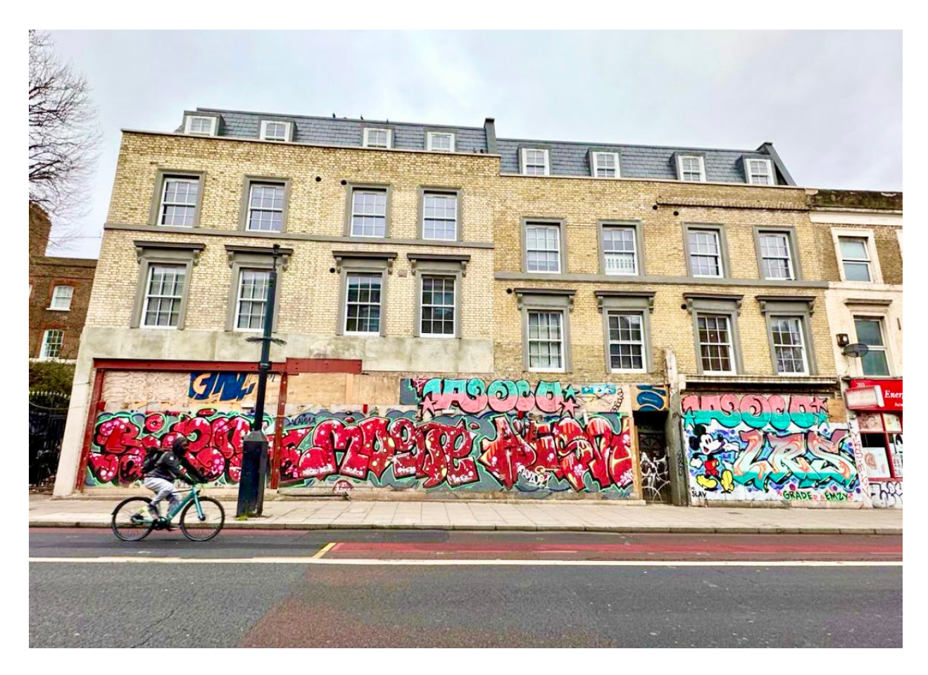
193-201 STOKE NEWINGTON ROAD N16 8BT